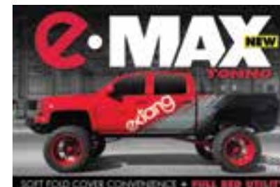
E-MAX POSTER (36 X 24-INCHES)