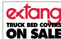
ON SALE BANNER PART #EOS BANNER (63 X 40-INCHES)