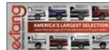
AMERICA'S LARGEST SELECTION BANNER PART #ALS BANNER (72 X 33-INCHES)