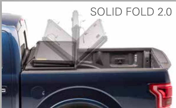
SOLID FOLD 2.0