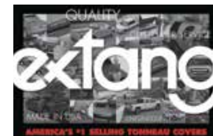
MOSAIC POSTER (36 X 24-INCHES)