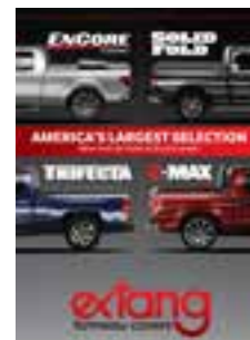
TRI POSTER (36 X 24-INCHES)

Colorful posters, perfect for any showroom.