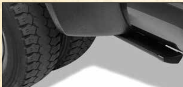
Part # 75407-15 shown on Dodge Ram retracted