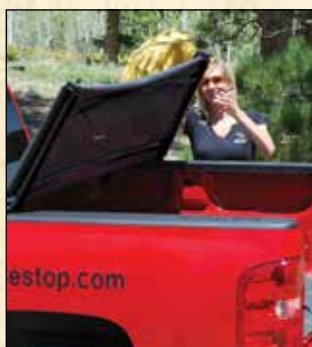
Clamps lock folded tonneau in place