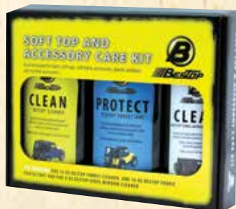
Bestop Fabric Care now available in a handy 3-pack. Part #11205-00