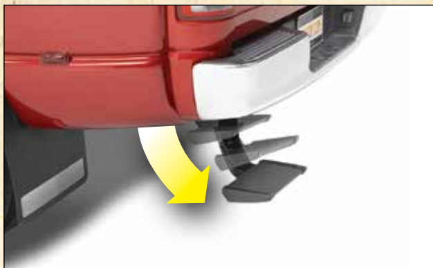
TrekStep® shown in motion