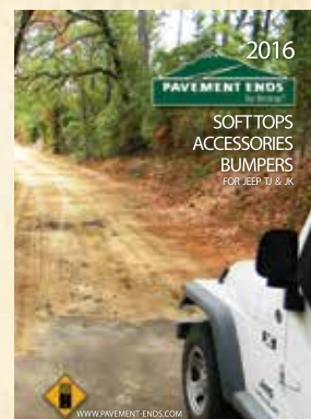
2016 Pavement Ends Catalog