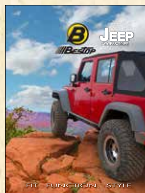
2016 Jeep Catalog

Visit Bestop's Facebook page for all the latest news and pictures and info from fellow Jeep & Truck enthusiasts