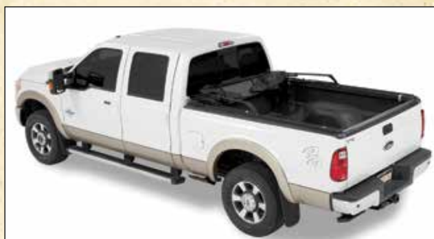
Shown folded in bed