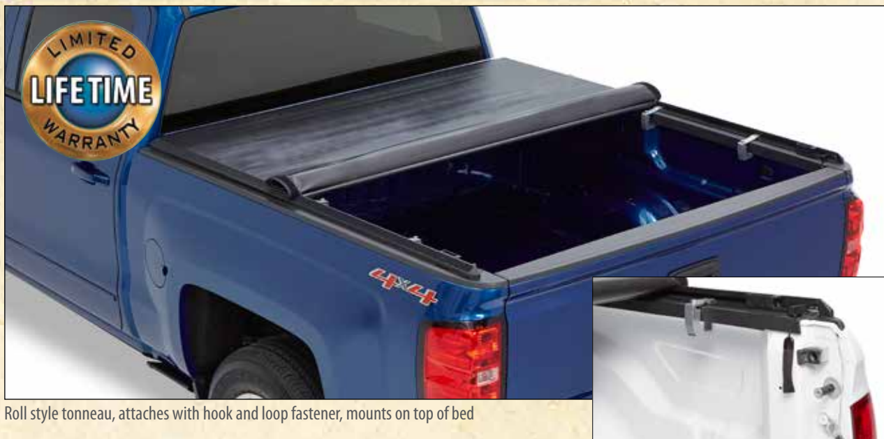
Roll style tonneau, attaches with hook and loop fastener, mounts on top of bed