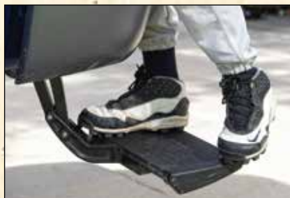
Spring-loaded step provides easy, hands-free operation