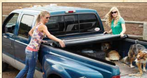
Super low profile design for contemporary looks