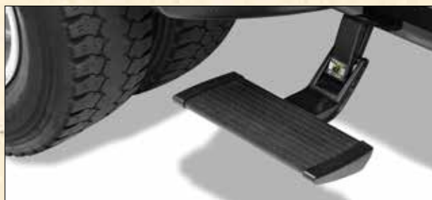
Part # 75407-15 shown on Dodge Ram extended