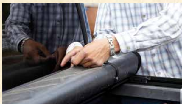
EZ Roll™ Tonneau shown on 2008 Dodge Ram