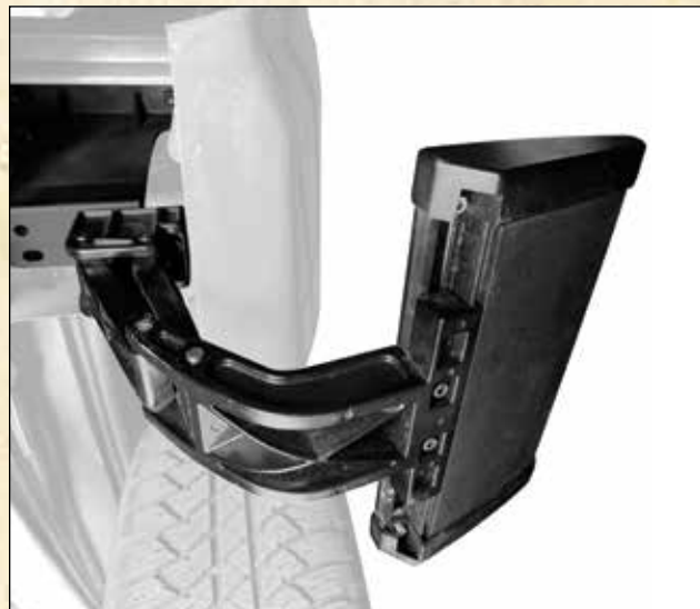
TrekStep® Side-Mount shown extended on 2010 Chevrolet Silverado