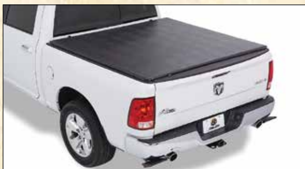
EZ Fold Tonneau shown installed on 2015 Ram 1500