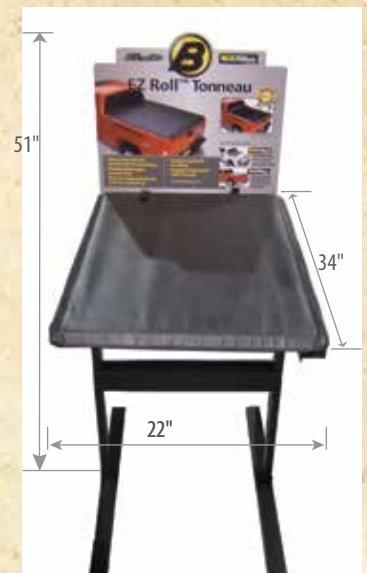
EZ Roll Tonneau Display: Part #17000-01 EZ Fold Tonneau Display: Part #16000-01 ZipRail Tonneau Display: Part #15000-01