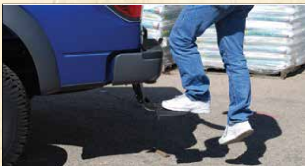
Ford F150 Raptor