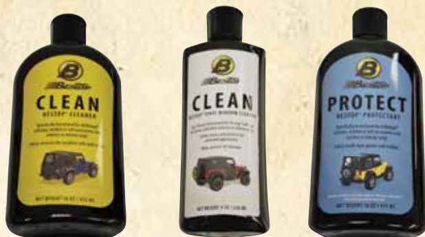
Part # 11201-00 Bestop Cleaner Part # 11203-00 Bestop Vinyl Window Cleaner Bestop Product Care bottles shown