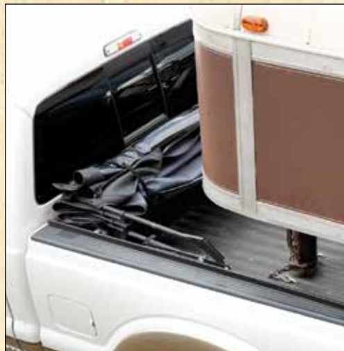
Conveniently folds in front of bed for access to fifth wheel and bed-mounted hitches