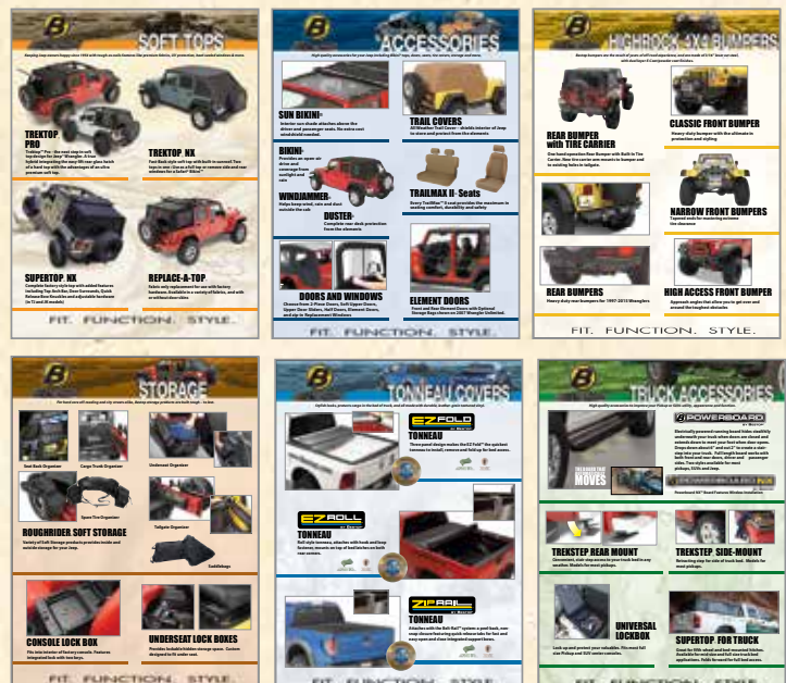
Jeep & Truck Product Wall Posters, set of 6: (18"W x 24"H) Part #446.43

Do you sell Bestop® Jeep Products too? Sign up for the Bestop® Jeep Authorized Dealer program! To learn more and to apply, go to www.Bestop.com