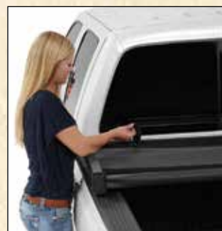
Folded and secured in back of cab, the EZ Fold™ allows for nearly full bed use