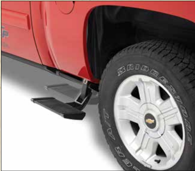
TrekStep® Side Mount shown in motion