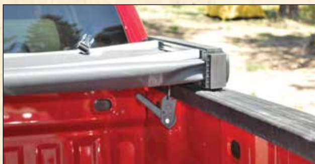
OEM quality, heavy duty adjustable clamps secure tonneau to truck bed