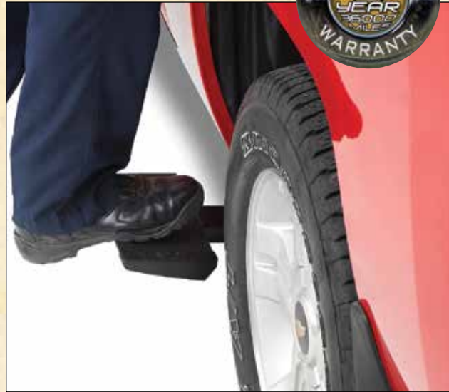
TrekStep® Side Mount shown extended