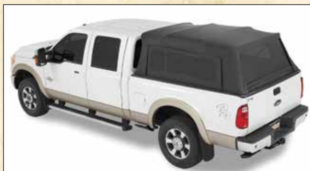
Shown with tinted windows