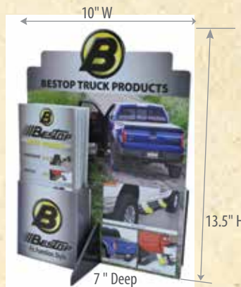
Jeep and Truck Counter Brochure Holder: Part #39313-00