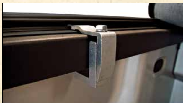
No-drill installation clamps secure frame rail assembly to bed