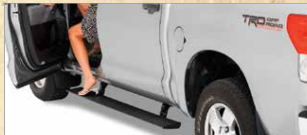
Shown on 2008 Toyota Tundra