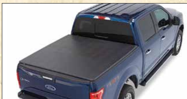
EZ Roll Tonneau shown installed on 2015 Ford F-150