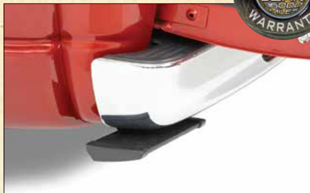
TrekStep® shown retracted