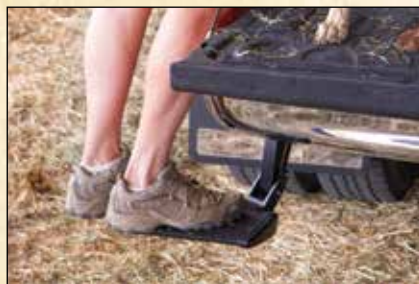
Slip resistant aluminum step pad works in all climate conditions