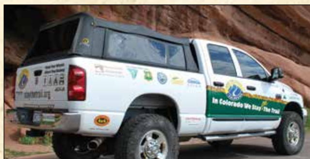
Stay the Trail's ( www.staythetrail.org ) support truck uses Bestop's Supertop for Truck