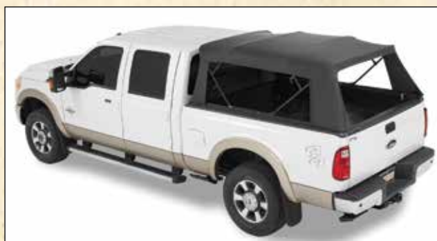
Shown with windows removed