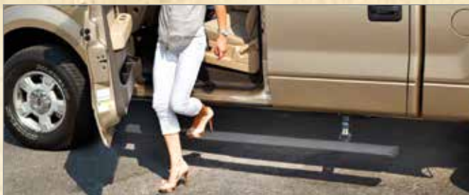
Shown on 2012 Ford F150