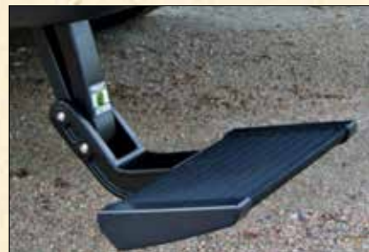
TrekStep® extended for easy bed access