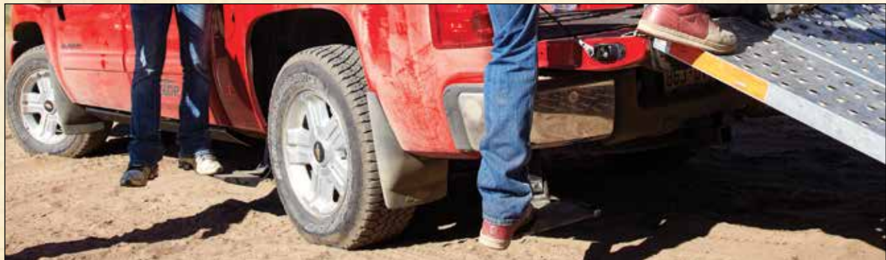
TrekStep® works with tailgate up or down