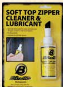
Bestop Soft Top Zipper Cleaner & Lubricant. Part #11206-00