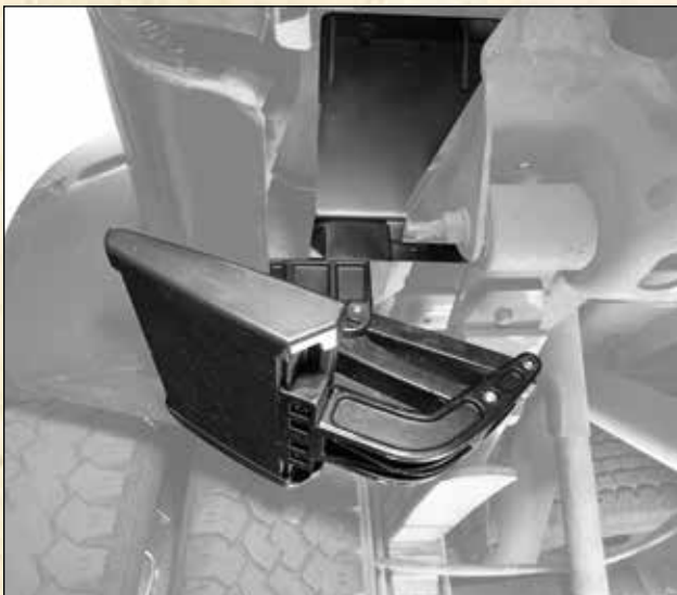
TrekStep® Side-Mount shown on 2010 Dodge Ram Dually