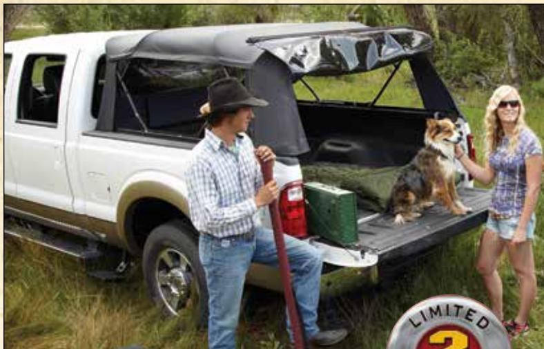
Part #76307-35 shown on 2012 Ford F250