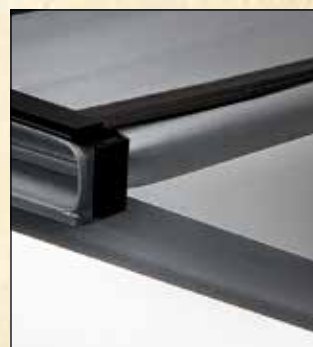
Reinforced corner and hinge construction